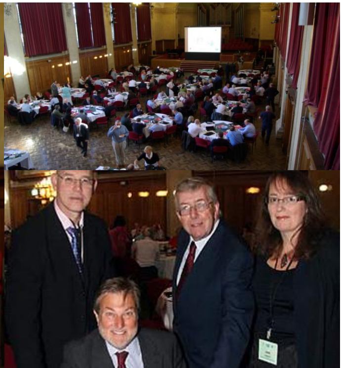
Lord McKenzie of Luton witnessing Bangor University's signing of 'The Pledge' at the 2009 Conference